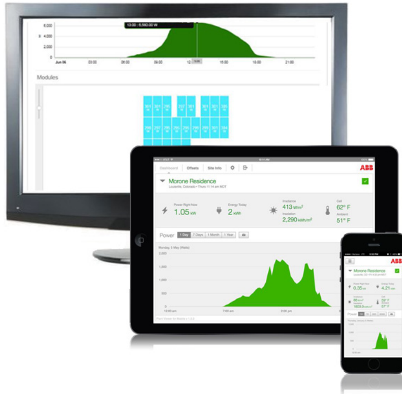
ABB monitoring and communications Aurora Vision® Plant Management Platform

Aurora Vision® Plant Viewer for Mobile is a series of products that empowers customers to strategically monitor their solar power plant(s) using ABB inverters.